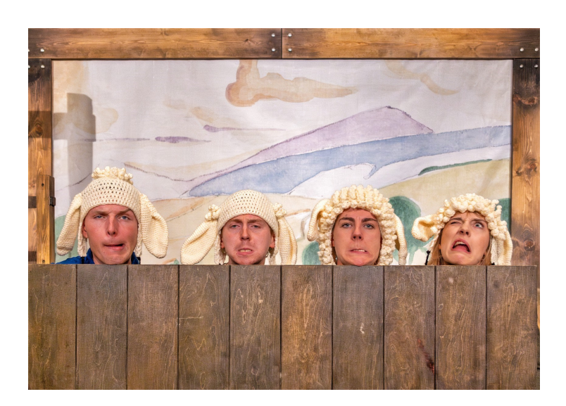
Rambling and our rights of way

Thursday 29 August 2024 at 7pm in Tontine Gardens